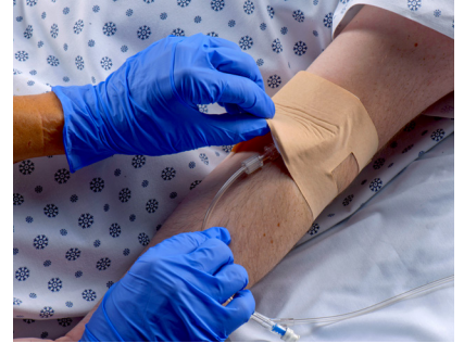
The stretch material allows the clinician to view the site.

The flexible protective overlay maximizes IV patency while protecting the site from patient tampering. IV-ARMOR reduces the introduction of infection associated with IV reinsertion.